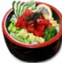
7. Poke Bowl Set $11.95 Sushi rice topped with slices of tuna sashimi marinated in poke sauce, avocado, edamame, seaweed salad, cucumber, & tempura crunch.