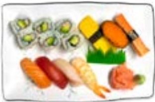
1. Sushi Special Set $13.95 California roll with 7 pcs nigiri (tuna, salmon, shrimp, whitefish, egg, masago, imitation crab).