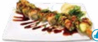
20. Tiger Roll Set $14.50 Shrimp tempura, avocado, spicy mayo topped with seared salmon, avocado, eel sauce & green onions.*

* Roll Set Side Options (choose one): • 3 piece Nigiri Set ($2.00 extra) • Small Salad or Seaweed Salad