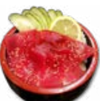
8. Tekka Don (Tuna Bowl) Set $13.95 Sushi rice topped with slices of tuna sashimi, cucumber & sesame seeds.