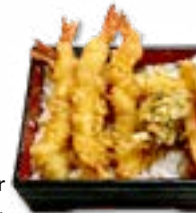
31. Ebi Tenju $13.50 Shrimp & vegetable tempura over steamed rice. Includes miso soup.