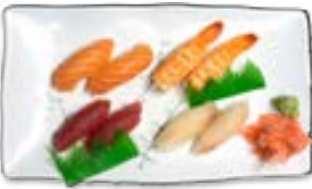
4. 8 Piece Special Set $12.95 2 pcs tuna, 2 salmon, 2 shrimp, and 2 whitefish nigiri. (No substitutions)