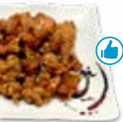
26. Chicken Karaage Set $10.95 Japanese style deep-fried chicken pieces. Includes salad, miso soup & rice.