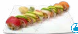
14. Big Rainbow Roll Set $13.50 Spicy crunch California roll topped with tuna, salmon, whitefish & avocado.*