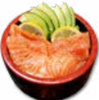
6. Salmon Don Set $12.95 Sushi rice topped with slices of salmon sashimi, cucumber, lemon & sesame seeds.