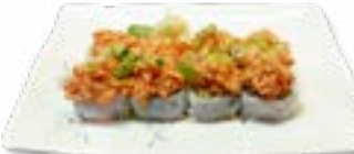
16. Big Spicy Scallop Roll Set $13.50 Spicy crunch California roll topped with spicy scallop salad & green onions.*