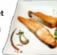
33. Grilled Salmon Set $12.50 Grilled salted salmon with salad, miso soup & rice.