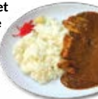
30. Pork Cutlet Curry Rice $11.50 Spicy curry sauce over rice, served with salad.