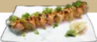
13. King of Salmon Set $13.95 Spicy crunch California roll with soy paper & seared salmon topped with green onions, spicy mayo & citrus sauce.*