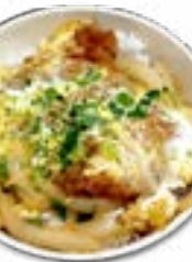
29. Katsu Don $11.50 Deep-fried pork cutlet (or salmon) with egg & onion over steamed rice. Includes salad & miso soup.