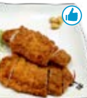
28. Berkshire Pork Cutlet Set $11.50 Deep-fried Berkshire pork cutlet. Includes salad, miso soup & rice.