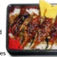
32. Unaju $13.95 Grilled eel over steamed rice topped with eel sauce. Includes miso soup.