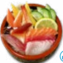
5. Chirashi Bowl Set $12.95 Sushi rice topped with tuna, salmon, octopus, whitefish, shrimp, surf clam, shiitake, egg custard, cucumber & lemon.