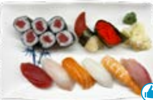
2. Sushi Deluxe Set $15.95 Tuna roll with 8 pcs nigiri (tuna, salmon, shrimp, yellowtail, squid, surf clam, whitefish, masago).