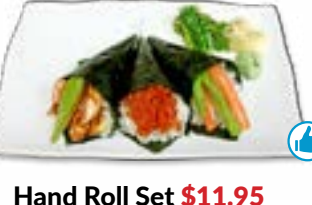
3. Hand Roll Set $11.95 3 hand rolls: salmon avocado, spicy tuna, and California.