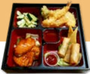
25. Nadeshiko Bento Box $14.95 Salmon teriyaki, shrimp & vegetable tempura, fried spring rolls, cucumber salad, miso soup & rice.