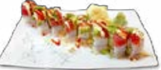
18. Red Dragon Roll Set $13. Spicy crunch California roll topped with tuna, avocado, wasabi mayo, sriracha, & green onion.*