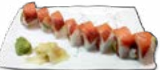
15. Oregon Roll Set $14.50 Sushi roll with soy paper, tuna, avocado & spicy mayo topped with smoked salmon.*