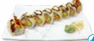
19. Godzilla Roll Set $13.50 Shrimp tempura, avocado, cream cheese, tobiko and tempura crunch topped with eel sauce & wasabi mayo.*