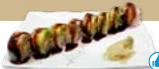
17. Big Dragon Roll Set $13.95 Spicy crunch California roll with eel and avocado topped with eel sauce.*