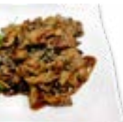
27. Chicken Teriyaki Set $10.95 Chicken sautéed in teriyaki sauce with mushrooms. Includes salad, miso soup & rice.