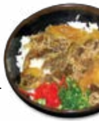
34. Beef Gyu Don Set $10.95 Beef and onions over steamed rice. Includes miso soup.